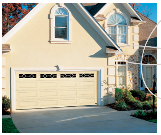
Long Panel design with Waterford Decratrim in Almond.